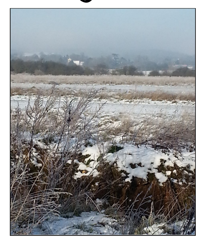
Tewin Village from the south-west

The front cover picture this month is a view from the edge of Panshanger Airfield looking across towards Tewin, taken in mid-January.