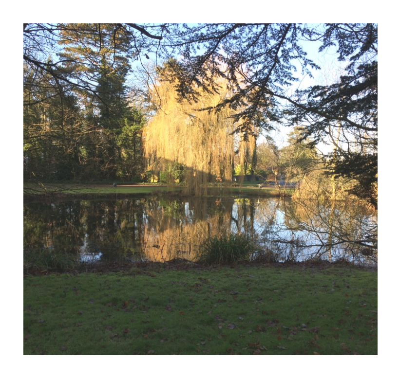
Harmer Green Pond