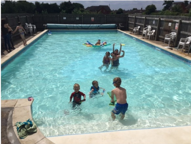
Tewin Cowper School Swimming Pool