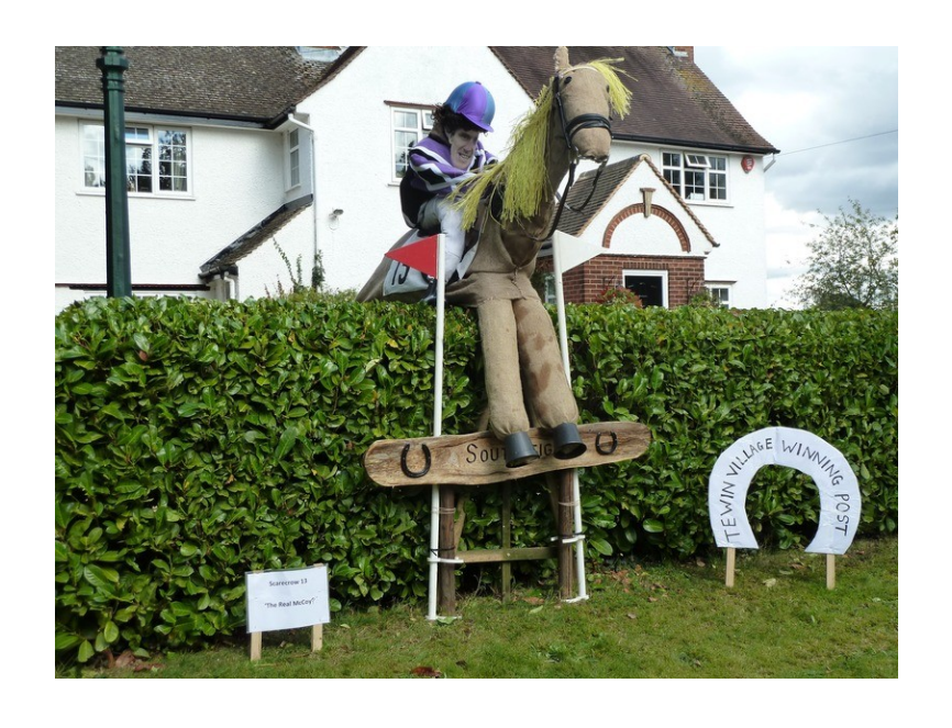
Scarecrows Take Over Tewin!