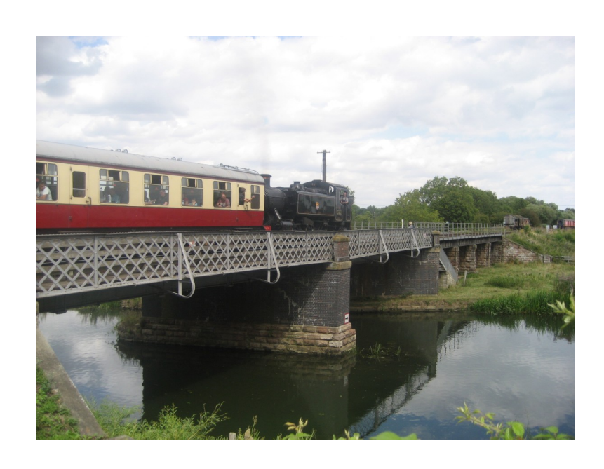
Tewin Visits The Nene Valley Railway