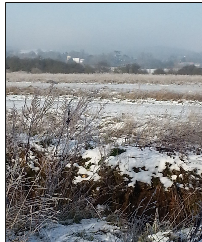
Tewin Village from the south-west

The front cover picture this month is a view from the edge of Panshanger Airfield looking across towards Tewin, taken in mid-January. The view has a beautiful serenity about it. A perfectly clear sky, rolling fields, managed woodlands and an occasional property. A beautiful country scene for us all to share together. Though the winter weather isn't always as appealing as it could be, I have to admit there's nothing more invigorating than walking along a footpath or round the edge of a field when you are well wrapped up against the elements.