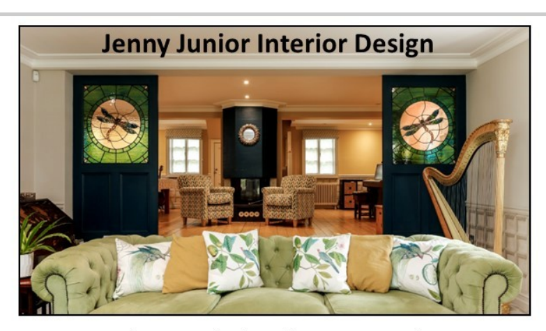
Award winning, timeless design, from concept to completion. Design consultation in your own home.

Country house specialists, bespoke furniture, designer fabrics, wallpaper and paint. Handmade curtains and blinds. Unique kitchens and bathrooms. Lighting, flooring, art and upholstery.