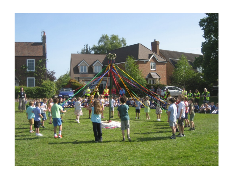
Maypole Dancing on Lower Green