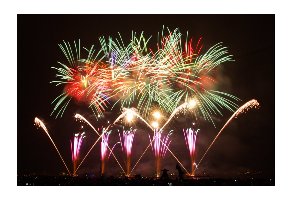
November Means Bonfire Night