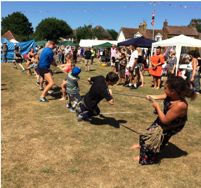
Tewin Pulls Together at Village Fete