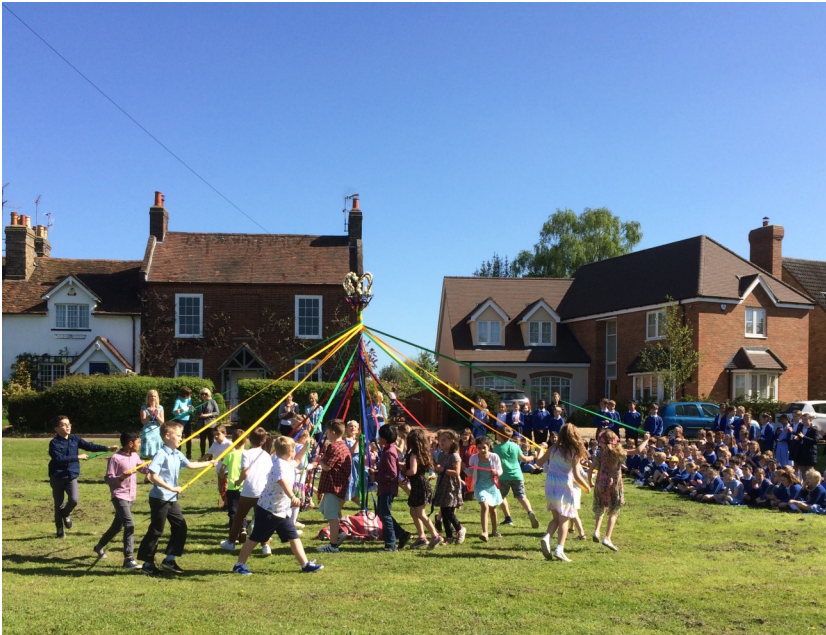
Tewin School Maypole Dancers