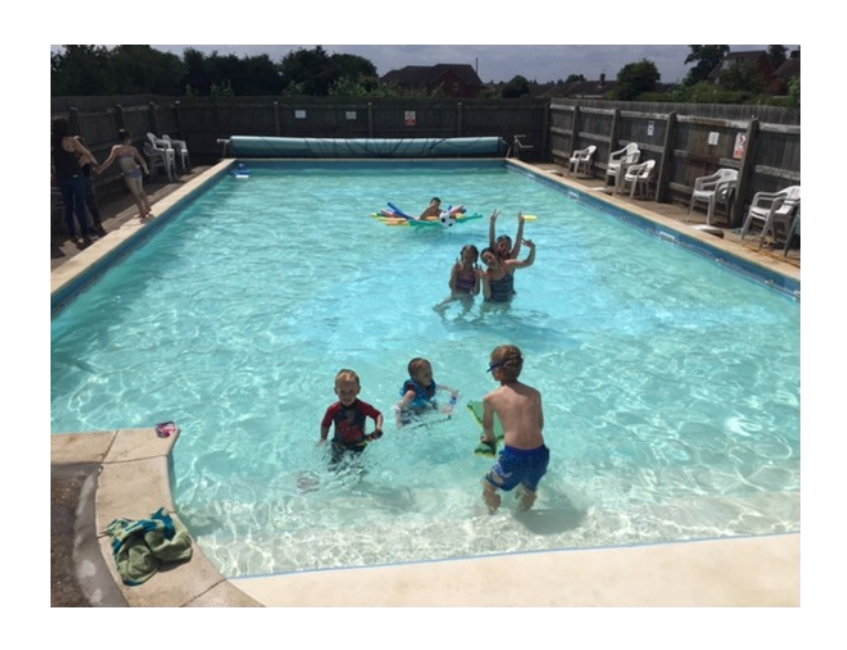
Tewin Cowper School Swimming Pool