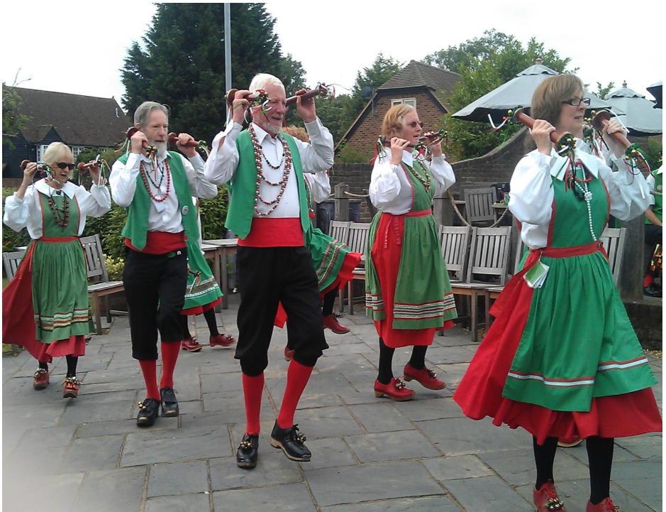
Morris Dancing in Tewin