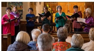
A new women's chamber choir in Hertfordshire